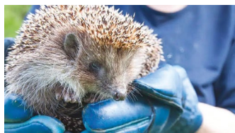
Ecological Clerk of Works