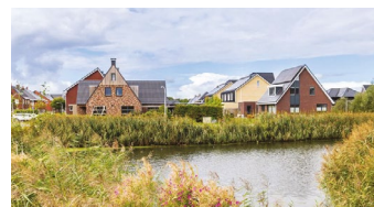
Green Infrastructure Planning