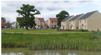
Sustainable Drainage Systems