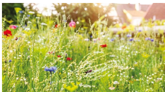
Biodiversity Net Gain