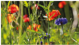
Habitat Survey and Assessment

English Estates provides full turnkey support to developers, including assisting with all mandatory environmental and ecological assessments, utilising a combination of our in-house team and key long-term established partnerships.