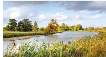
Ecological Impact Assessment (EclA)