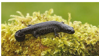
Great Crested Newt Surveys