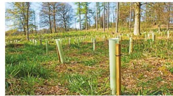
Habitat Creation and Restoration